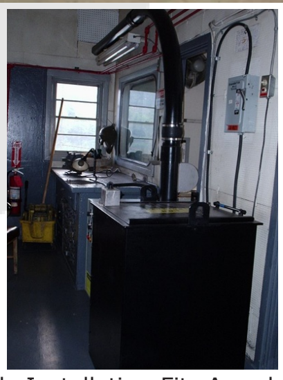
Simple Controls and Operation