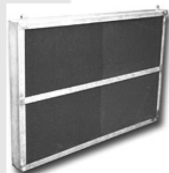
Ret-Pak Media Pack