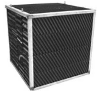
Flow-Thru Media Packs

The Flow-Thru media promotes oil & fuel removal by providing a controlled path for the wasteflow. See the Separation Theory page (on website) for more information on Flow-Thru media operation & theory.